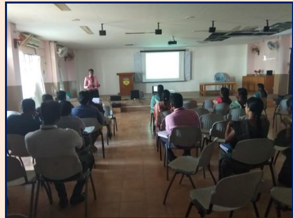
Audience listening the seminar